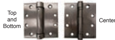
Heavy Duty Hinges