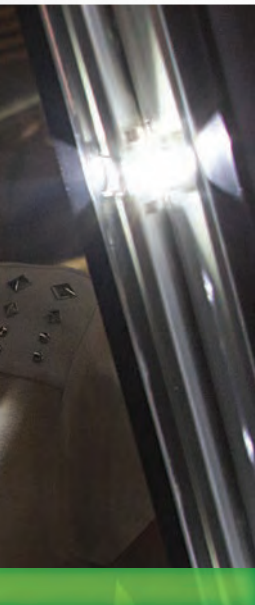
UNIFORMITY 60" Fixture (Product Display Measured at 4")